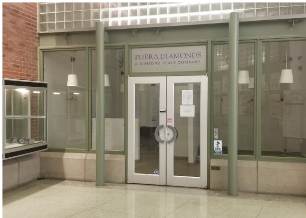
UNIT # | R001 RENTABLE AREA | 332 SF