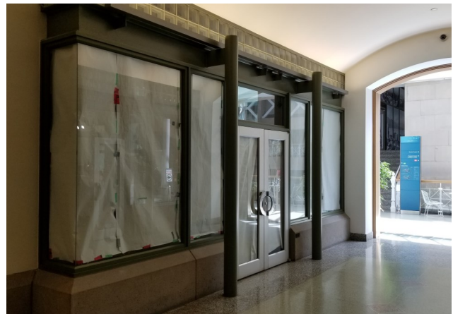
UNIT # | R002 RENTABLE AREA | 941 SF

This disclaimer applies to BGIS Global Integrated Solutions Realty Inc./BGIS Société Immobilière Solutions Globales Intégrées Inc. and to all other divisions of BGIS Global Integrated Solutions Canada LP ("BGIS"). The information set out herein, including, without limitation, any projections, images, opinions, assumptions and estimates obtained from third parties (the "Information") has not been verified by BGIS, and BGIS does not represent, warrant or guarantee the accuracy, correctness and completeness of the Information. BGIS does not accept or assume any responsibility or liability, direct or consequential, for the Information or the recipient's reliance upon the Information. The Information may change and any property described in the Information may be withdrawn from the market at any time without notice or obligation to the recipient. All Rights Reserved. Not intended to solicit anyone currently under contract.